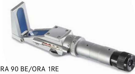
ORA 90 BE/ORA 1RE